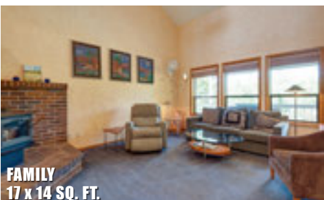
FAMILY 17 x 14 SQ. FT.