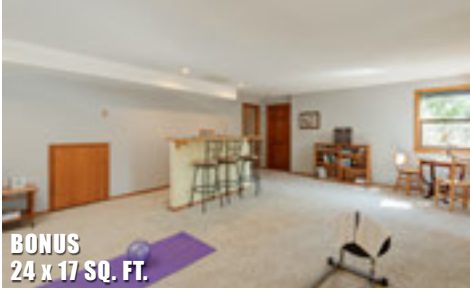
BONUS 24 x 17 SQ. FT.