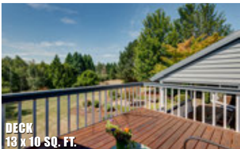
DECK 13 x 10 SQ. FT.