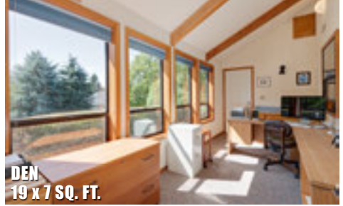
DEN 19 x 7 SQ. FT.