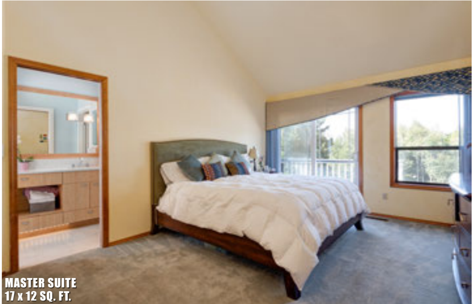
MASTER SUITE 17 x 12 SQ. FT.