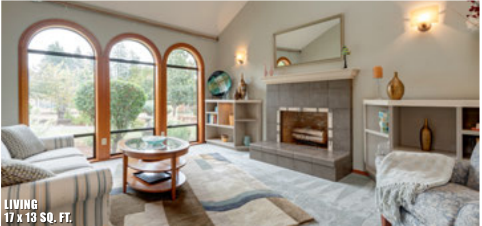
LIVING 17 x 13 SQ. FT.