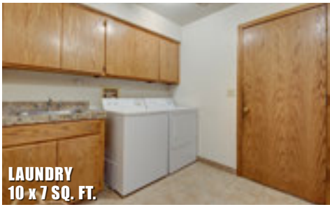
LAUNDRY 10 x 7 SQ. FT.