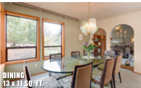
DINING 13 x 11 SQ. FT.