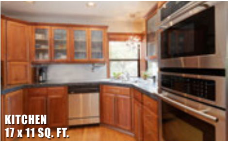
KITCHEN 17 x 11 SQ. FT.