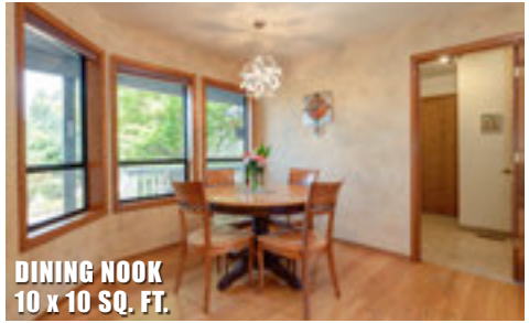
DINING NOOK 10 x 10 SQ. FT.